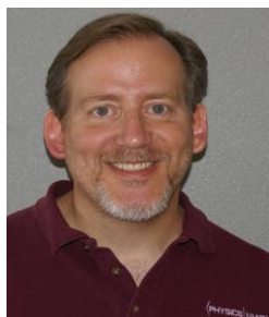
Conference General Chair

I hope you enjoy your stay in the home of cowboys, Native Americans, and Mexican culture, and I look forward to meeting each and every one of you.